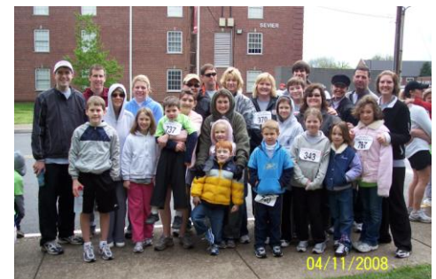
CCS students, faculty & families at the Queen City Road Race

Additionally, CCS earned a participation award for having over 10% of their student population participating in the 5K run!