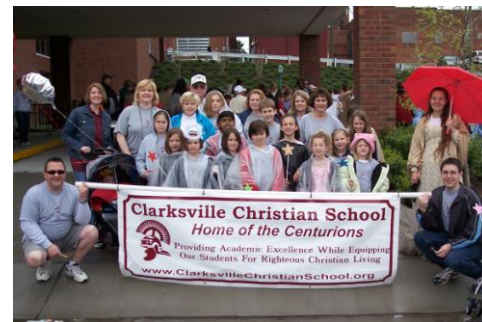
Students participating in the Rivers and Spires Children’s Parade

On April 19, CCS students and their families laced up their walking shoes again and participated in the Rivers and Spires Children’s Parade for the second year. A good time was had by all as they walked through the downtown area and passed out candy and information about CCS to parade-watchers.